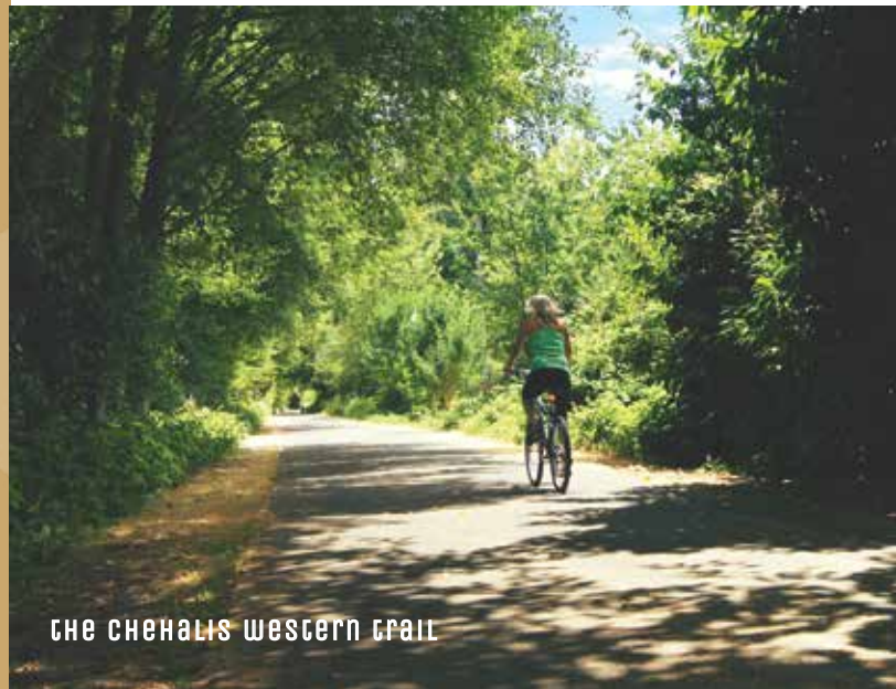
THE CHEHALIS WESTERN TRAIL

The Village at Mill Pond has not only a Commercial Center and Community Building at its center, but it's also located in the heart of Olympia, close to a hospital, schools, parks, waterfront access, and the famous Olympia Farmers Market. Nestled along the Puget Sound, Olympia boasts sweeping views of the Olympics, dark evergreen forests, and thundering rivers, all accessible within just a short drive from the city limits.