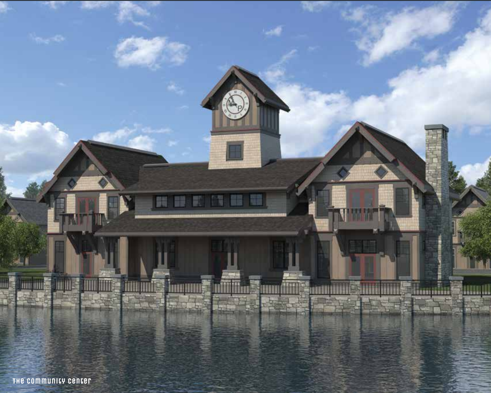
THE COMMUNITY CENTER

ONE OF A KIND | CRAFTSMAN STYLE + CONTEMPORARY LIVING